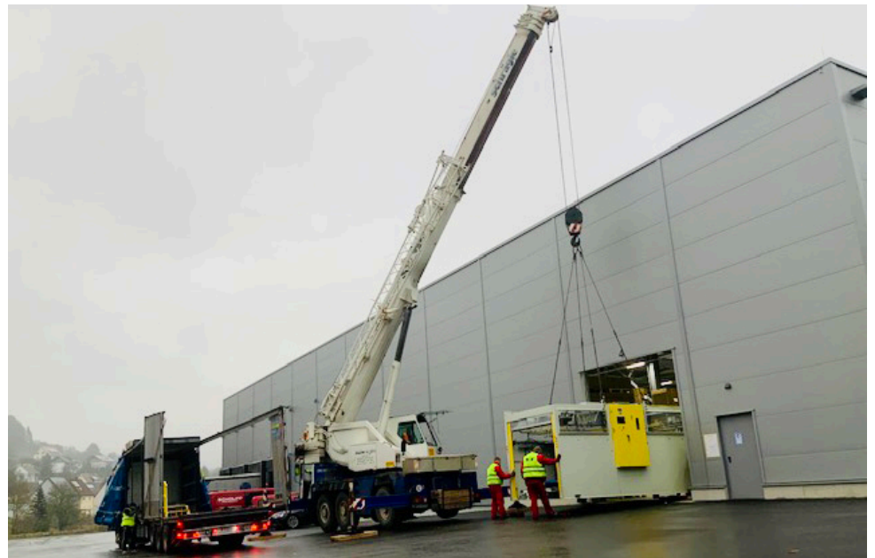
The Baysek C-170 die cutter entering Mayer Kartonagen headquarters in Haiterbach, Germany, 14 December 2020.

With a total of 100 employees at two locations (headquarters in Haiterbach in the Black Forest and a branch in Ottersweier near the Baden Region), Mayer Kartonagen processes a proud 15 million square meters of corrugated board (approximately 30 million individual packages) and generates sales of 14 million euros per year. A new hall completed in December 2019 is playing a key role in helping the company manage its growth and production capabilities.